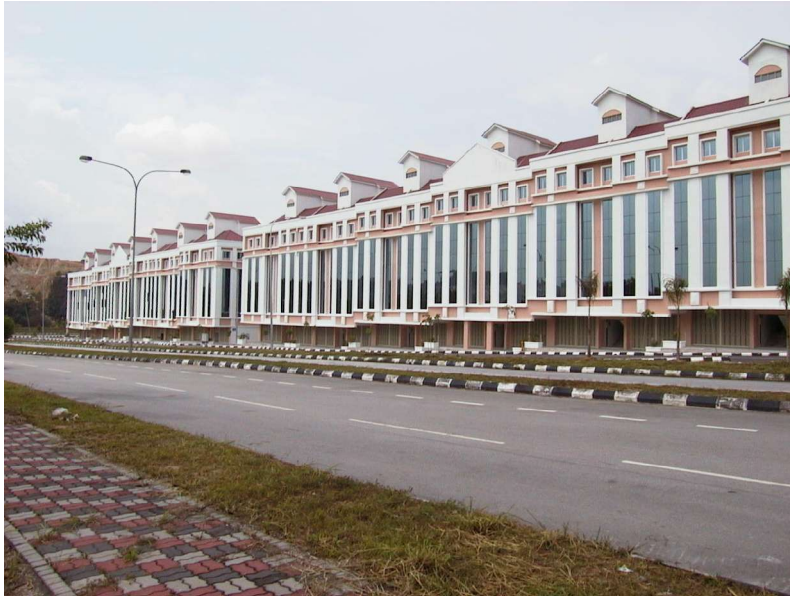
Medan Putra Business Centre, Kuala Lumpur