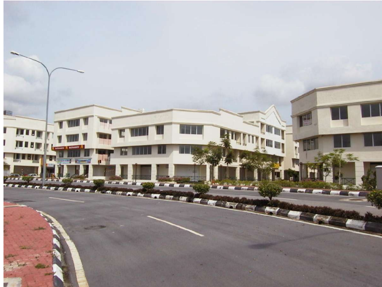
Diamond Shophouses, Bandar Baru Bangi