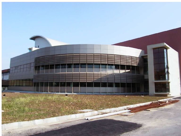
The News Straits Time Press(M) Regional Printing Plant, Prai, Penang