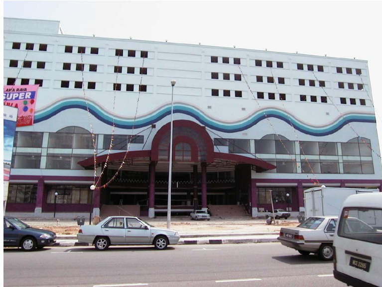
Melaka Raya Shopping Complex, Melaka