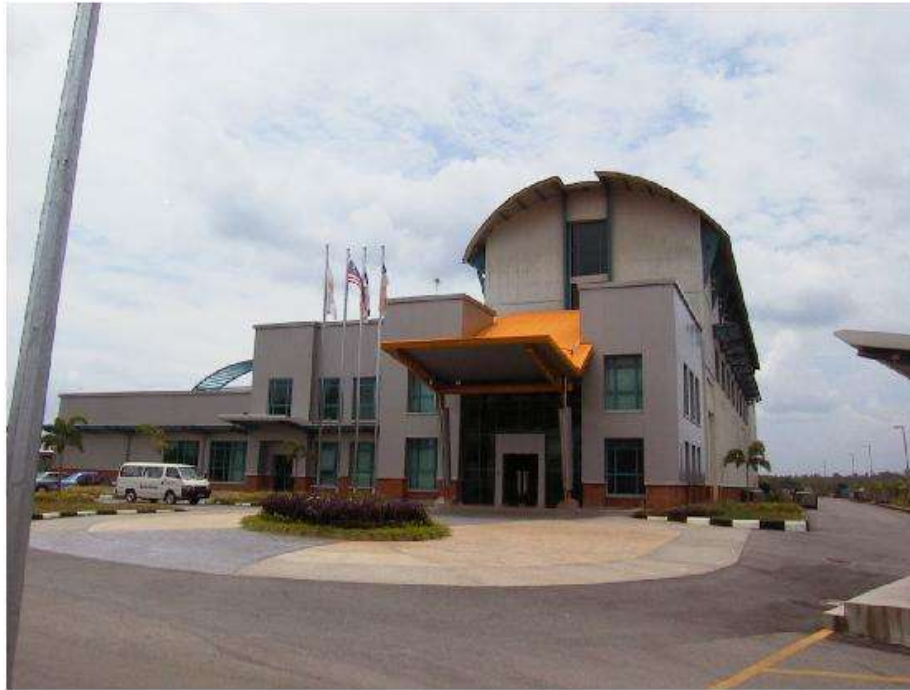
The News Straits Time Press(M) Regional Printing Plant, Ajil, Terengganu