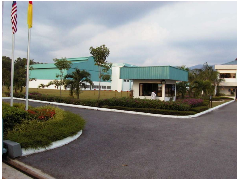
Nestle Ice Cream Factory, Chembong, Negri Sembilan