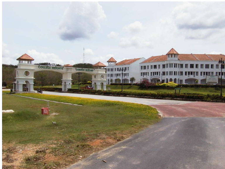
Country Height Commercial Development, Pajam, Nilai