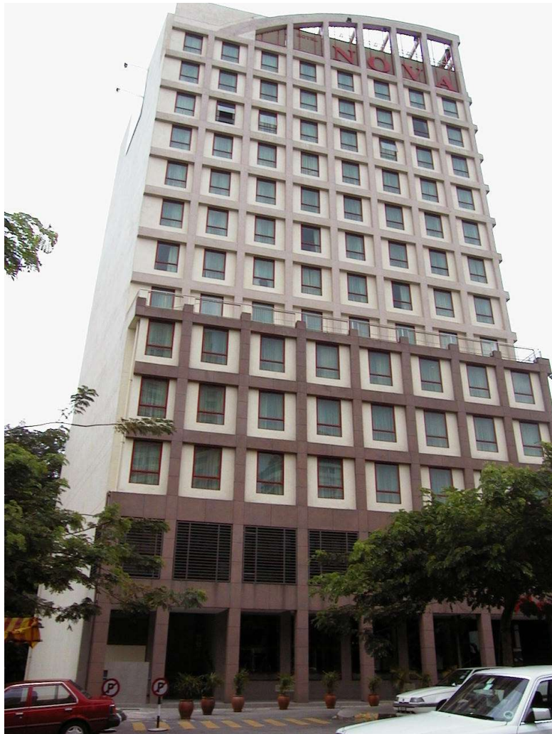
Nova Hotel, Jalan Alor, Kuala Lumpur