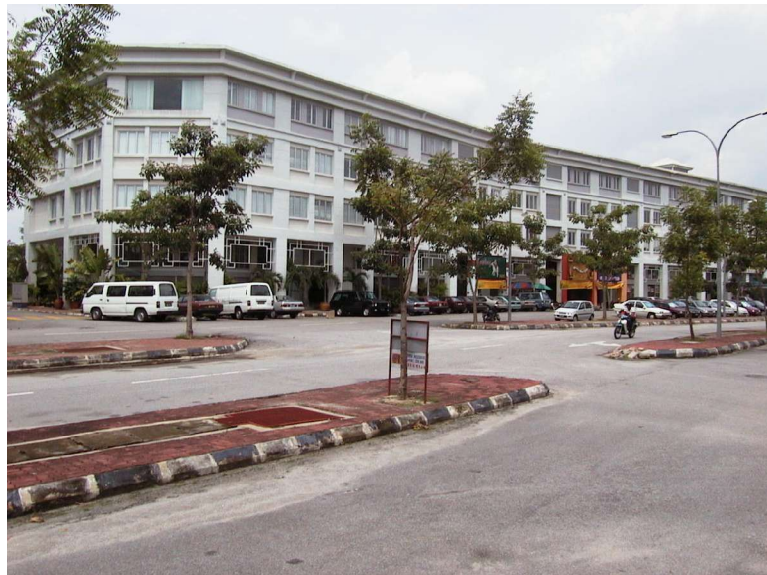
Warisan Business Centre, Jalan Kuching, Kuala Lumpur