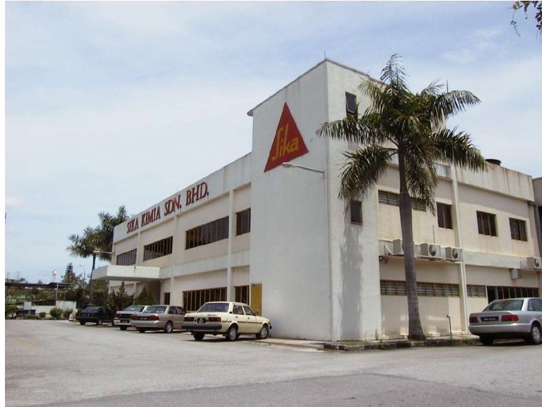
Sika Kimia Sdn Bhd Factory, Nilai