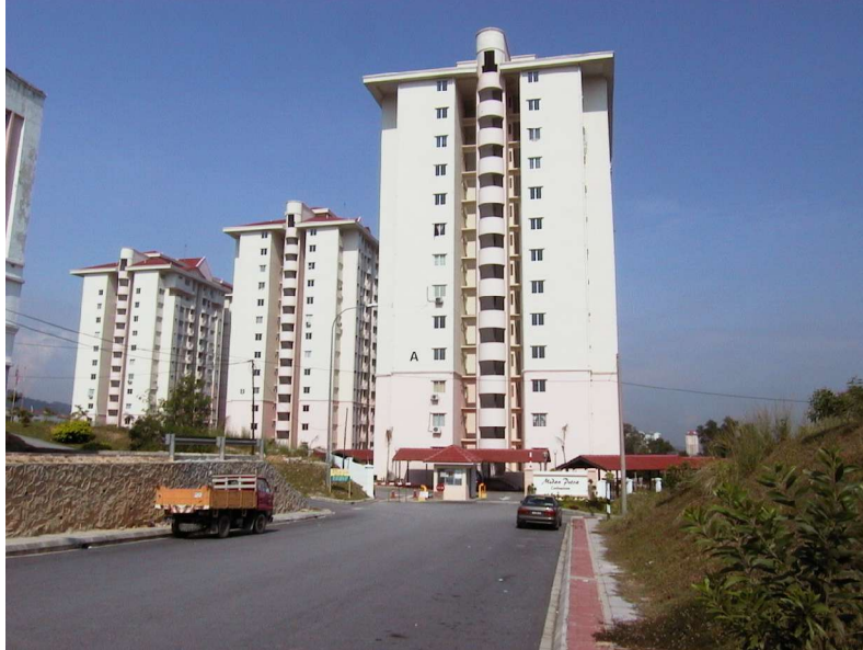
Medan Putra 14 Storey Condominium, Menjarala