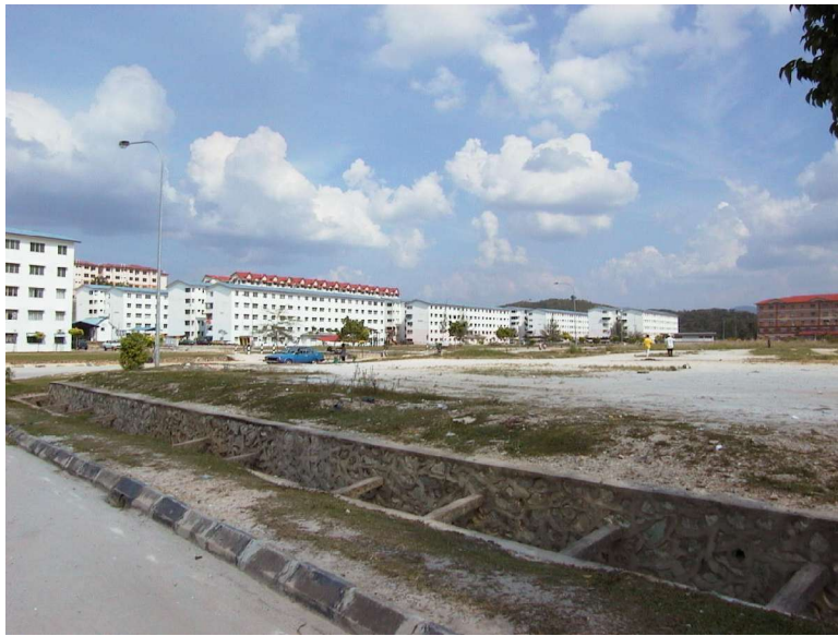
Tanco Properties Sdn Bhd Housing Development, Rawang