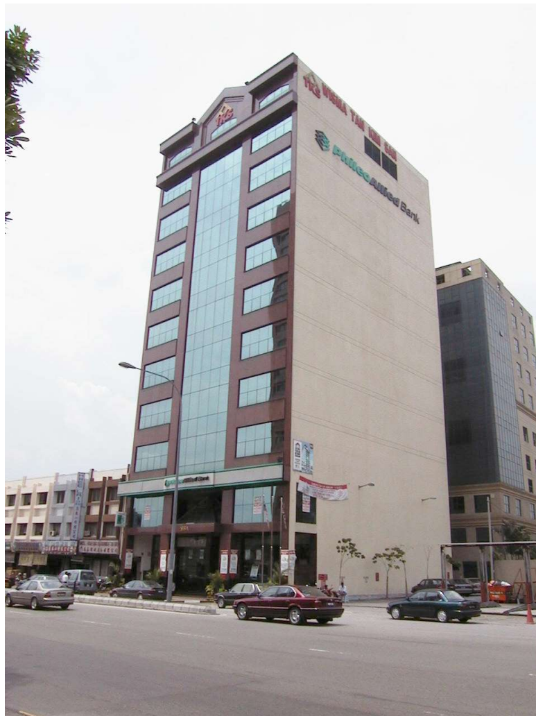
Wisma Tan Kim San, Jalan Ipoh, Kuala Lumpur